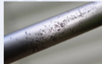
Pitting on Stainless Steel tube after 3 years' service.